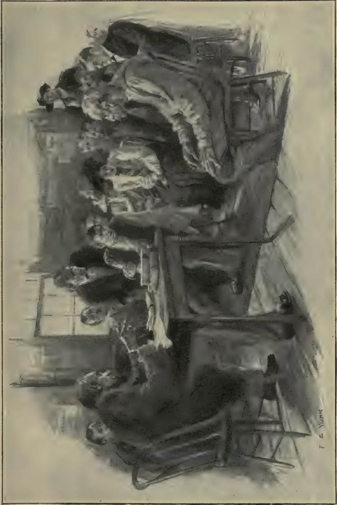
“If I’d a known hit was you I’d a stayed in jail.”